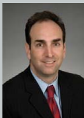
David Flum, MD, MPH "A Learning Health Care System: The science and practice of changing the way we do what we do."